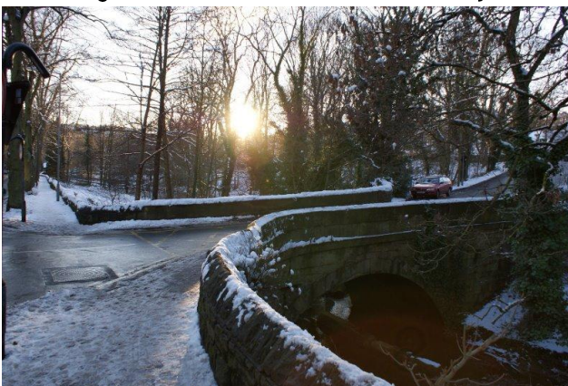
Hollins Bridge in the snow

(2) The river will lead you for the rest of the walk - just follow the path close to the river. When you reach stepping stones turn left and continue with Rivelin on your left hand side. After few minutes path will take you back to the main road for a while. On your right hand side you will find the Hollins Lane Bridge. Cross the bridge and immediately after the bridge cross the road and continue your walk on the 'Easy going trail' footpath.